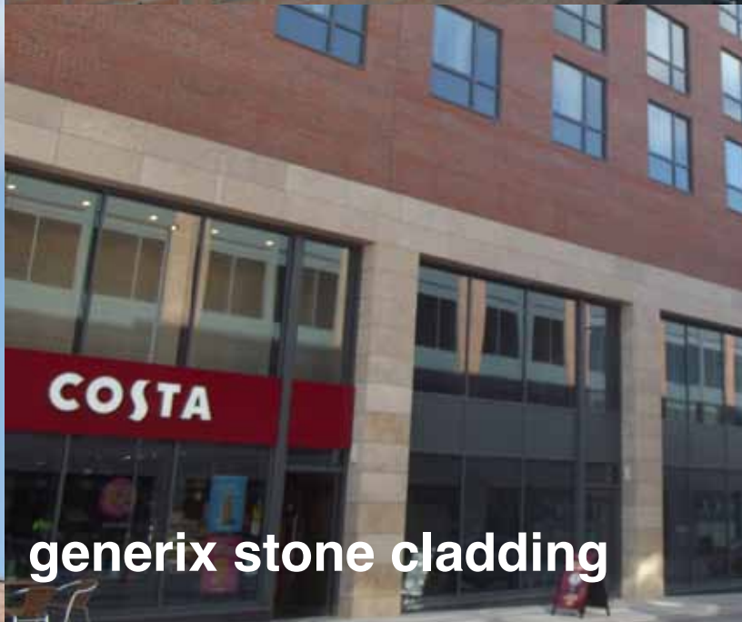
generix stone cladding